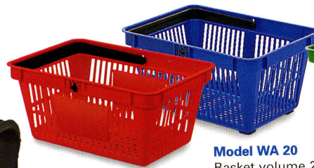
Model WA 20 Basket volume 20 litres